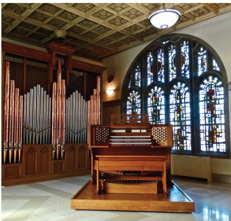
THEOLOGICAL COLLEGE, WASHINGTON, D.C.

is a full-line representative for pipe, digital, and hybrid organ solutions.