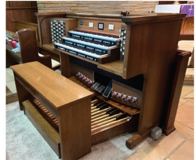
Macedonia Lutheran Church Burlington, North Carolina Rodgers Imagine 351