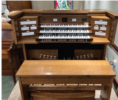
Saint James Catholic Church Conway, South Carolina Rodgers Imagine 351