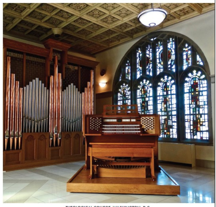
THEOLOGICAL COLLEGE, WASHINGTON, D.C.

is a full-line representative for pipe, digital, and hybrid organ solutions.