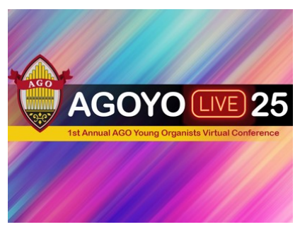
AGOYO LIVE 25 Virtual Conference

Friday, Feb. 7, 4:45 - 9 p.m. (ET) Saturday, Feb. 8, 9:45 a.m. - 3:45 p.m. (ET)