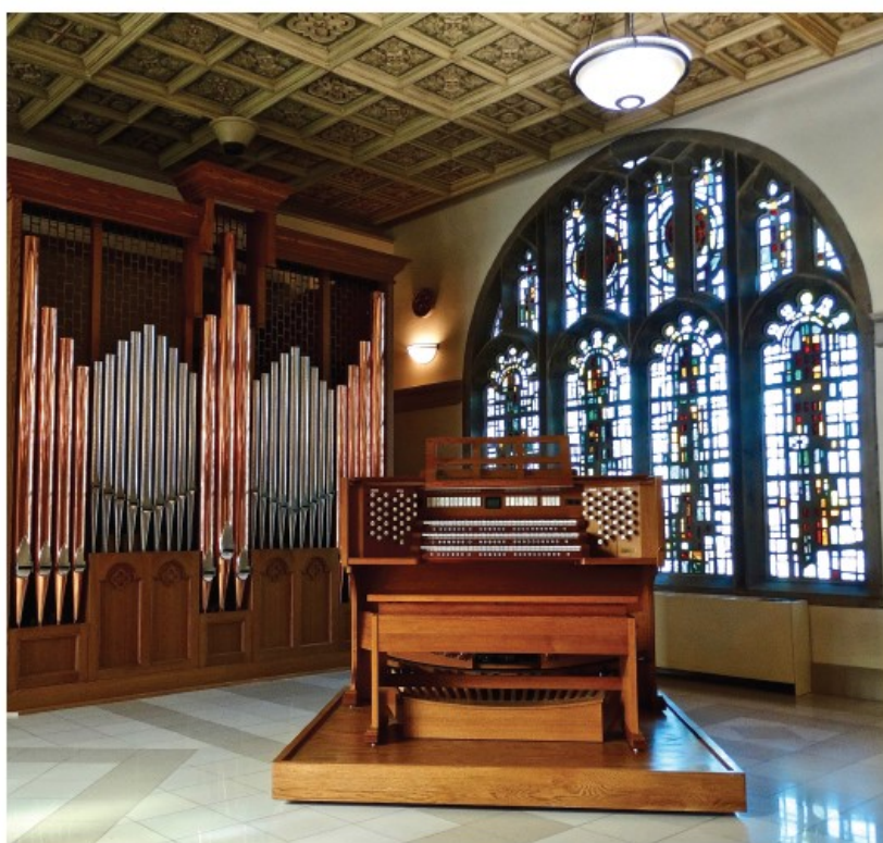
THEOLOGICAL COLLEGE, WASHINGTON, D.C.

is a full-line representative for pipe, digital, and hybrid organ solutions.