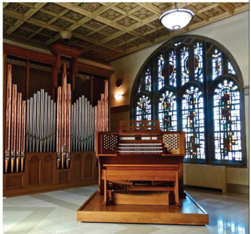
THEOLOGICAL COLLEGE, WASHINGTON, D.C.

is a full-line representative for pipe, digital, and hybrid organ solutions.